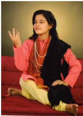
Balvidushi Shri Kshamadevi